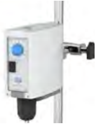
ES Up to 15 L Up to 1.000 mPa*s