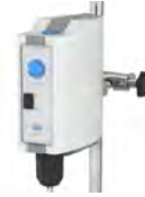
PW Up to 70 L Up to 100.000 mPa*s