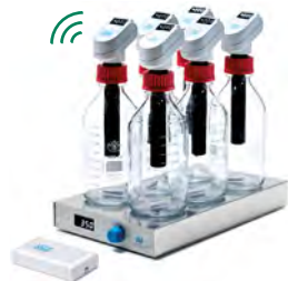
RESPIROMETRIC Sensor System for Plastic Analysis 6 positions - Results on display and RESPIROSoft™