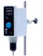
OHS 20 Digital Up to 25 L Up to 10.000 mPa*s