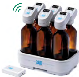
RESPIROMETRIC Sensor System - BOD 6 positions - Results on display and RESPIROSoft™