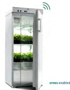
FOC 200 IL Connect From 3 to 50 °C