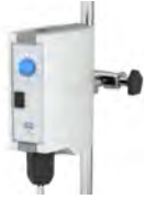
LS Up to 25 L Up to 25.000 mPa*s