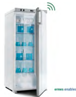
FOC 200 I Connect From 3 to 50 °C