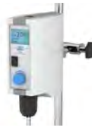
DLS Up to 25 L Up to 25.000 mPa*s