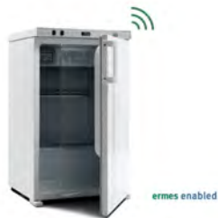
FOC 120 I Connect From 3 to 50 °C