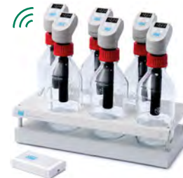
RESPIROMETRIC Sensor System MAXI - BMP 6 positions - Results on display and RESPIROSoft™