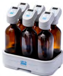
BOD Sensor System 6 - 10 positions - Results on display