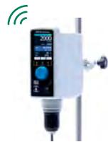
ermes enabled OHS 60 Advance Up to 40 L Up to 50.000 mPa*s