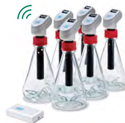
RESPIROMETRIC Sensor System for Soil Analysis Results on display and RESPIROSoft™