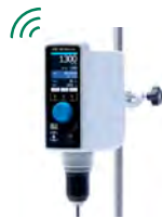
ermes enabled OHS 100 Advance Up to 100 L Up to 70 mPa*s