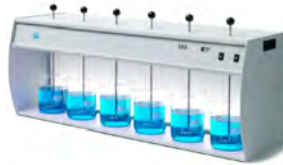
JLT 4 AND JLT 6