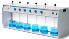
FC4S AND FC6S