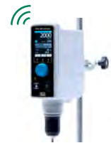
ermes enabled OHS 200 Advance Up to 100 L Up to 100.000 mPa*s