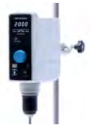
OHS 40 Digital Up to 25 L Up to 25.000 mPa*s